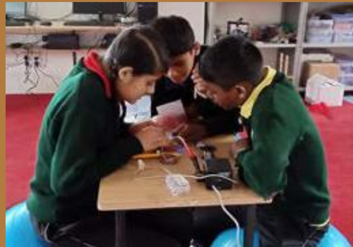
Row wise from top: Pottery class Meal time, Tinkering lab E-lab, Art room